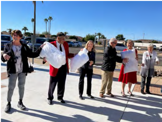
Willowbrook's play pass the pillow!